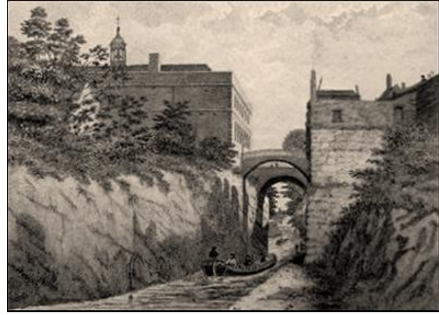
Chester City Walls at The Bridge of Sighs