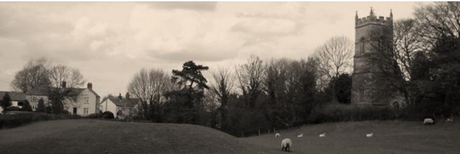
St Chad's church and churchyard, Farndon