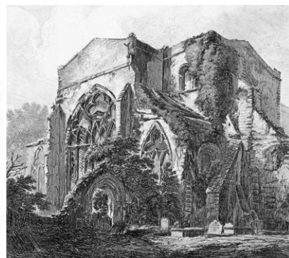
St John's Chester