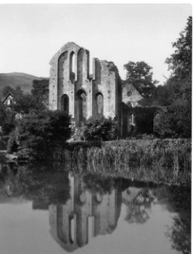
Valle Crucis Abbey