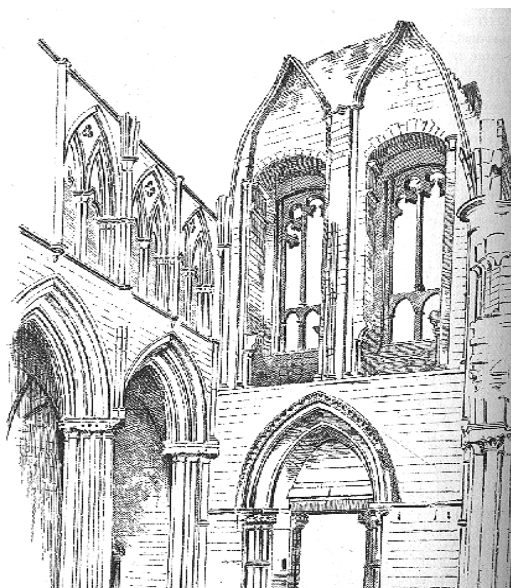
Remains of Holyrood Abbey; nave elevation to the southwest

This year's conference focuses on Changing Patterns in Scottish Church Landscapes which are considered through the findings of excavation work, analytical investigation & academic studies. Some of this work has only very recently been undertaken & the conference will provide the opportunity for new archaeological discoveries, research & insights to be outlined & discussed.